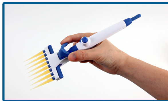
Shown with 8 Channel Pipette Tip Adapter (V0020-8)