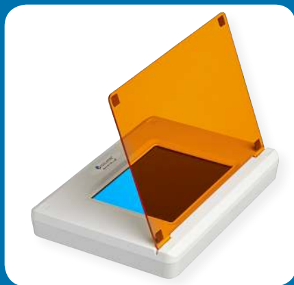
Amber cover raised for easy gel access

An array of super bright LEDs with a long, 30,000 hour service life provide the light source for the SmartBlue Transilluminator. Unlike those in a UV transilluminator, the filters in the SmartBlue will not solarize and degrade in performance over time. Gel bands can be excised directly on the scratch resistant, glass viewing surface. To save energy, the power switch includes an automatic 5 minute shutoff. The SmartBlue Transilluminator is covered by a 2 year warranty.