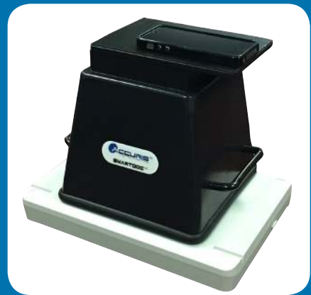
Use with SmartDoc™ for gel imaging with a cell phone