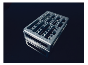
AP1016-ASR Aluminum rack