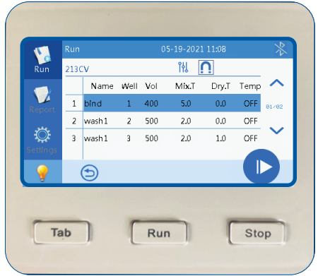
Touch screen control panel