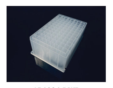
AP1096-DWP 96 deep well plate