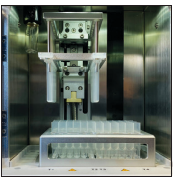
6-well sample strips loaded in aluminum rack