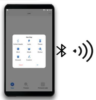
Create programs using any Android device, transfer via Bluetooth

A handheld scanner is included with each IsoPure Mini, adding a convenient and fast method for loading a protocol onto the instrument. After creating or opening a protocol on a companion Android device or a PC, an option is available for displaying a QR code. Simply scan the QR code to instantly transfer the protocol. QR codes are available from different kit manufacturers for instant loading of optimized protocols.