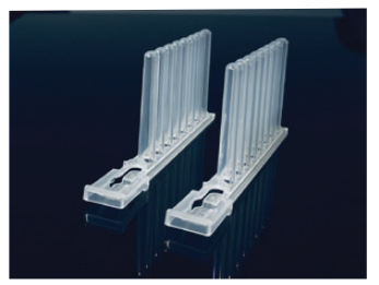
AP1016-MC 8-place tip comb