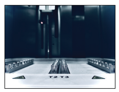
Heating block for lysis & elution

The control panel on top of the IsoPure Mini allows for quick selection of stored protocols and instrument control. To execute a protocol, select it from the file list, insert a prepared sample plate (or 6-well sample strips) and tip combs, and press the start button. Run parameters and operating status are displayed during sample processing.