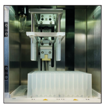
Deep-well plate for processing up to 16 samples

Accuris offers magnetic tip combs, deep well plates, and 6-well sample strips designed to fit the IsoPure Mini. Produced using virgin polypropylene and packaged in a sterile environment, these consumables are guaranteed to be contaminant-free. The 8-place magnetic tip combs lock into position inside the instruments processing chamber. There are 2 options for sample vessels: 96 deep-well plates can be used for processing up to 16 samples. For 8 or fewer samples, 6-well sample strips can be used, and these are loaded onto the included aluminum rack. These sample strips reduce waste and lower consumable costs when only a few samples need to be processed.